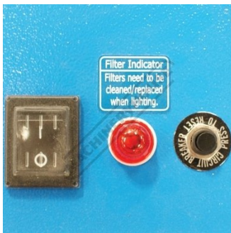
Filter replacement Indicator