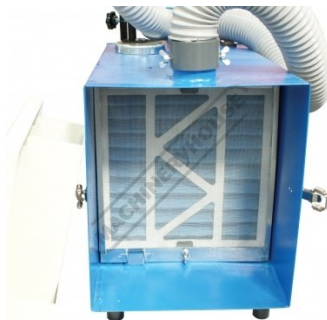
Easy Access to Filter