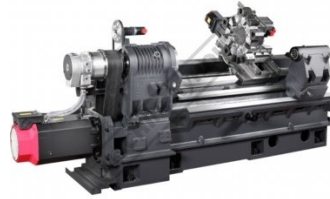
Puma GT Frame