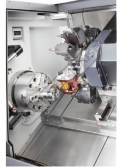
Puma GT Hobbing