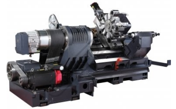
Puma 4100 Chassis