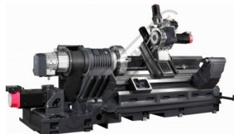
Puma 5100 Chassis