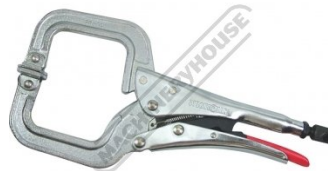
W1018 Locking C-Clamp - Swivel Tip