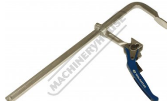
C0015 Ratchet F Clamp