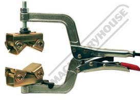
W1014 Pipe Plier - Large