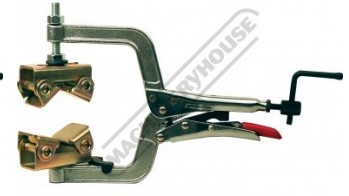
W1015 Pipe Plier