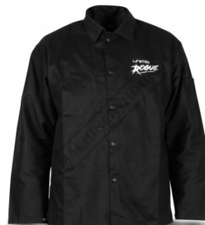
W1003 ROGUE™ PROBANO® Welding Jacket