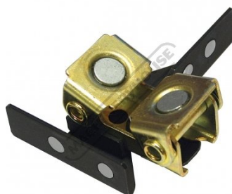
W1022 MagTab Magnet