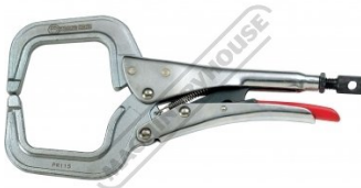
W1016 Locking C-Clamp - Round Tip