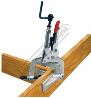
W1013 Corner Clamping Plier