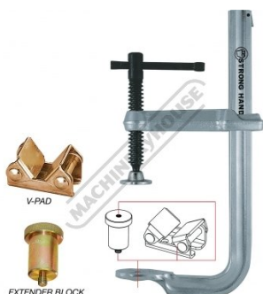
W1026 4 In One Utility Clamping System