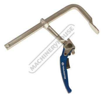
C0012 Ratchet F Clamp