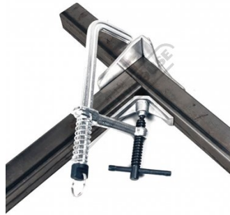
W1019 Corner Clamp