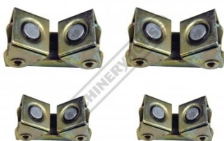
W1021 Magnetic V-Pad Kit - (4 Pack)