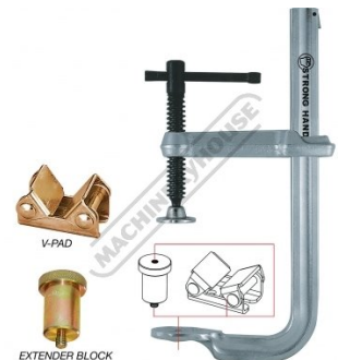
W1025 4 In One Utility Clamping System