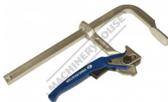
C0013 Ratchet F Clamp