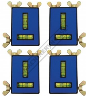
W115 Precision Welding Aluminium Clamp Set