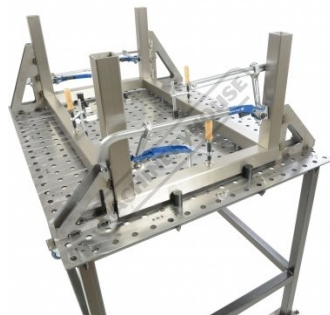
Shown With Optional Square Tube Framing Kit 5