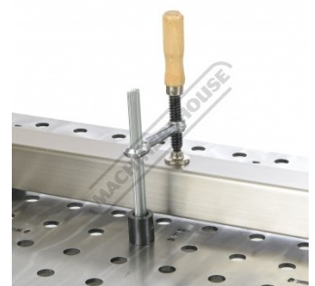
Shown With Optional Square Tube Framing Kit 7