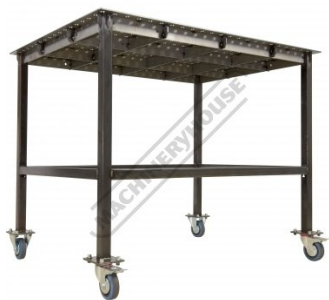
Under View With Optional Wheels