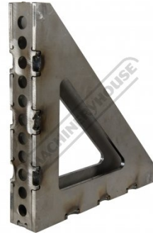
W08164 CertiFlat FabSquare