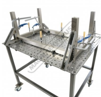
Shown With Optional Square Tube Framing Kit 4