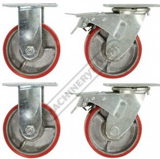
C411 Industrial Caster Wheel Set