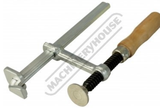
W07890 FixturePoint Inserta Clamp