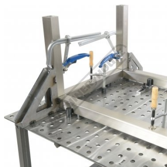
Shown With Optional Square Tube Framing Kit 9