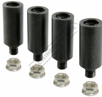
W08515 Multi-Purpose Riser/Stops