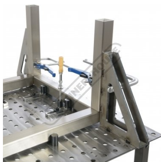
Shown With Optional Square Tube Framing Kit 8