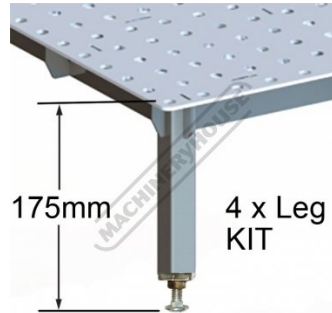
W07799 CertiFlat PRO Series - Short Leg Kit