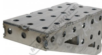
W07850 CertiFlat FabWing