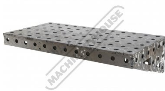
W07852 CertiFlat FabWing