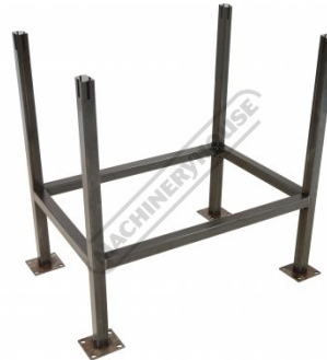
W07801A CertiFlat PRO Series - Long Leg Kit