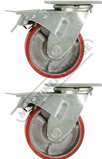
C412 Industrial Caster Wheels