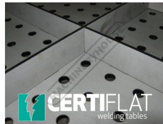
CertiFlat Welding Table Tab and Slot Design