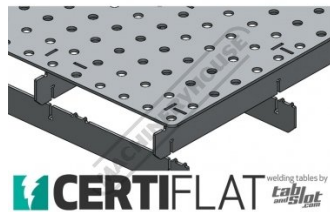
Tab and Slot Design