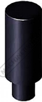
W07891 Buildpro Inserta Stop