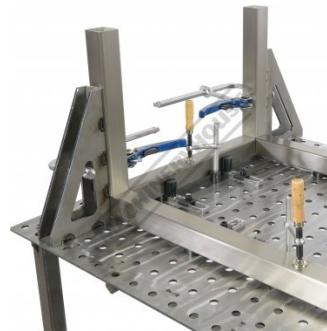
Shown With Optional Square Tube Framing Kit 6