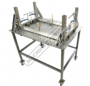
Shown With Optional Square Tube Framing Kit 3