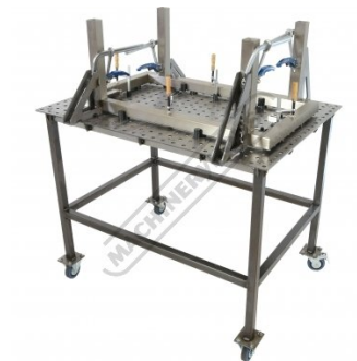
Shown With Optional Square Tube Framing Kit 2