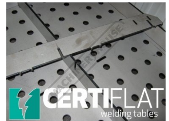
CertiFlat Welding Table Tab and Slot Designed Pieces