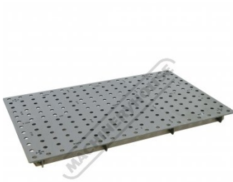
W07801 CertiFlat PRO 1D Welding Table Top