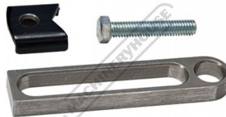
W07895 FixturePoint D-Stop Bar