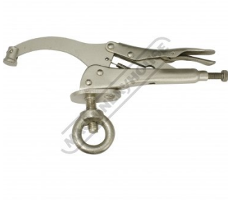
C103 9" Drill Press Locking Clamp