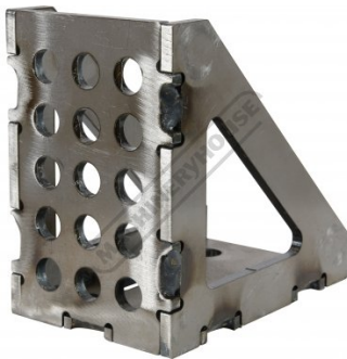
W08170 CertiFlat FabSquare