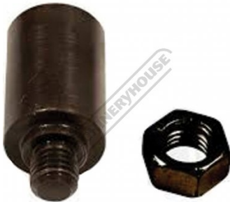
W07892 FixturePoint Positioning Stop - Threaded