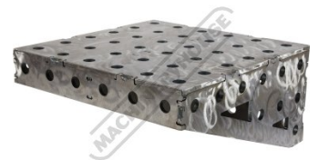
W07851 CertiFlat FabWing