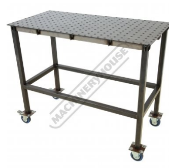
Left View Shown With Optional Wheels