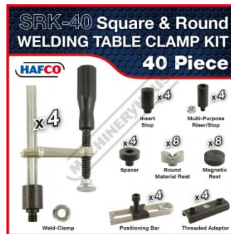
W08510 2 x Weld Clamps with Locking Nuts