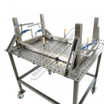
Shown With Optional Square Tube Framing Kit 4