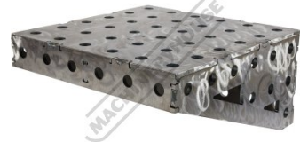
W07851 CertiFlat FabWing