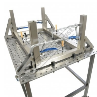
Shown With Optional Square Tube Framing Kit 5