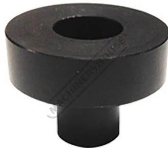
W07895 FixturePoint D-Stop Bar