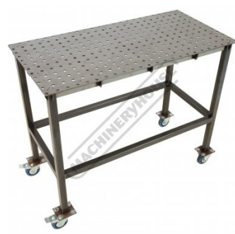
Top View Shown With Optional Wheels