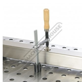
Shown With Optional Square Tube Framing Kit 7