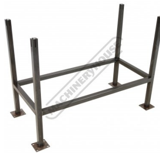
W07802A CertiFlat PRO Series - Long Leg Kit