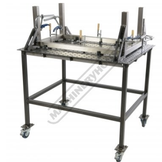
Square Tube Setup with Accessories