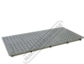
W07802 CertiFlat PRO 1D Welding Table Top