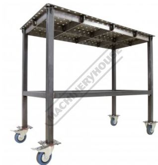
Under View Shown With Optional Wheels