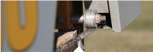
PRECISION BLADE GUIDES WITH SEALED BEARINGS