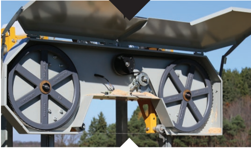
EASY-ACCESS BLADE CHANGES