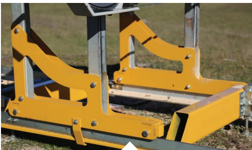
PATENTED LOWER CARRIAGE SYSTEM