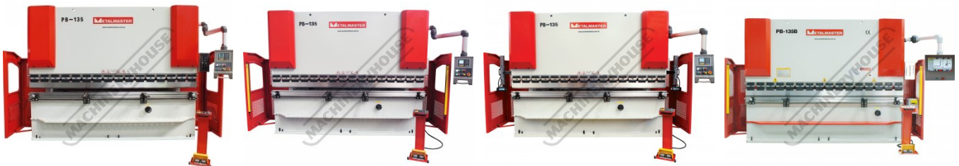
S908F Hydraulic CNC Pressbrake