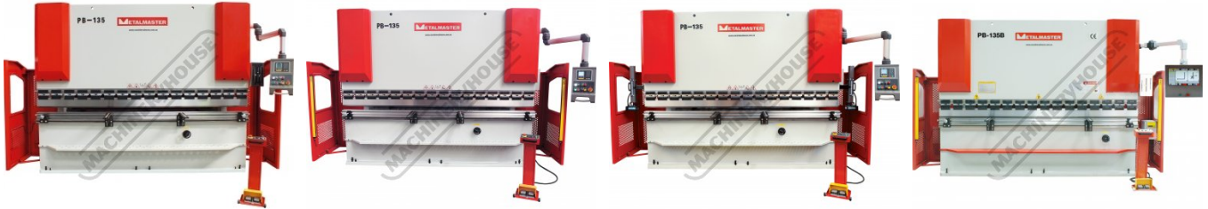
S908 Hydraulic NC Pressbrake