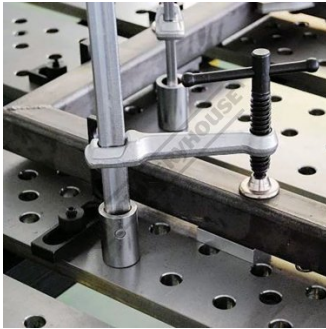
Instant Clamping into any Hole on the BuildPro Tabletop