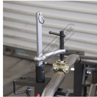
Inserta Clamps are an ideal choice in terms of easy of use affordability