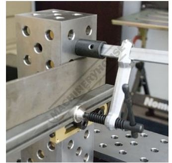
Inserta Clamps can be used in any orientation