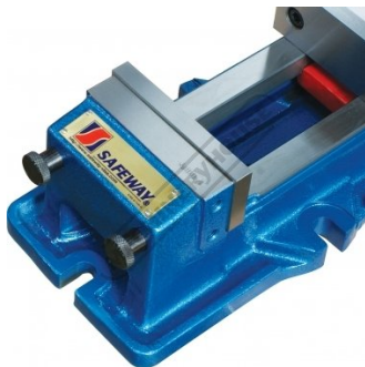
Knurled Head Lifting Pins