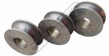
Includes 50mm Pipe Dies