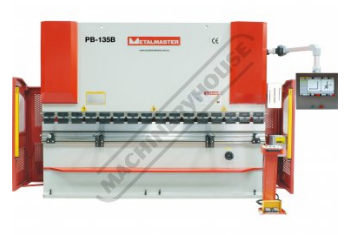
S906F Hydraulic CNC Pressbrake