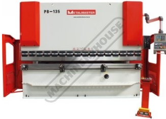
S906 Hydraulic NC Pressbrake