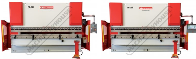
S912F Hydraulic CNC Pressbrake