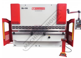
S908G Hydraulic NC Pressbrake