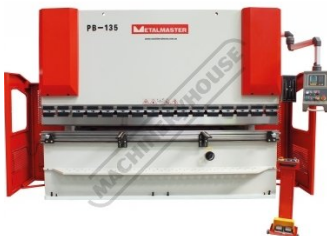
S908 Hydraulic NC Pressbrake