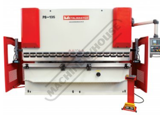
S908GL Hydraulic NC Pressbrake