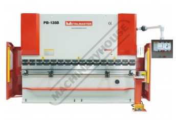
S908F Hydraulic CNC Pressbrake