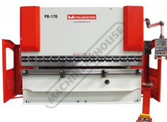
S909 Hydraulic NC Pressbrake