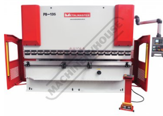
S906G Hydraulic NC Pressbrake