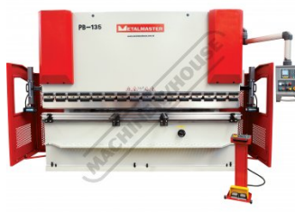
S906GL Hydraulic NC Pressbrake