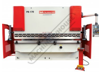
S909GL Hydraulic NC Pressbrake