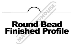
Round Bead Finished Profile