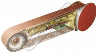
L088 Multitool Belt & Disc Linishing Attachment