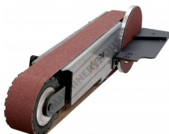
L085 Multitool Belt & Disc Linishing Attachment