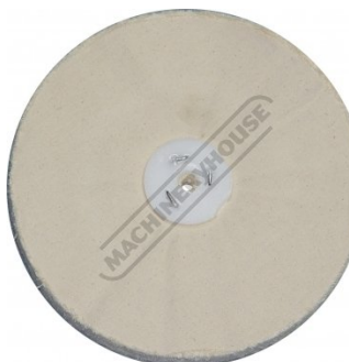
G186A Buffing Mop