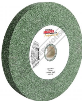
G170 Silicon Carbide Grinder Wheel