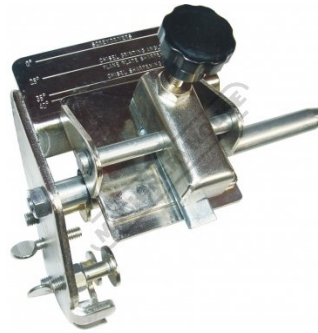
L083 Multitool Chisel Sharpening Jig