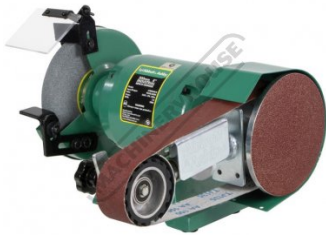
AA362W8 Abbott & Ashby Grinder & Linisher