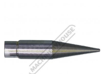
G184 Tapered Buffing Spindle - Left Hand