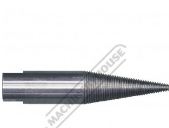
G184A Tapered Buffing Spindle - Right Hand