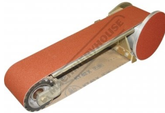
L089 Multitool Belt & Disc Linishing Attachment