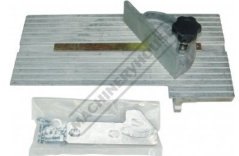
L086 Multitool Tilting Table & Mitre Guide