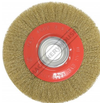
G188 Grinder Wire Wheel - Crimped