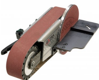
L0912 Industrial Belt & Disc Linishing Attachment