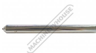
G189A Grinding Wheel Dresser - Rotary Cutter Type