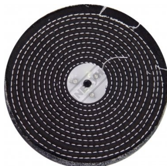
G186 Buffing Mop