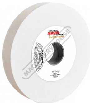
G171 White - Alox Grinder Wheel