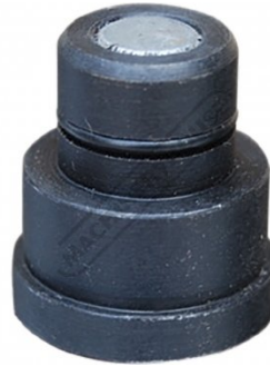
W08020 BuildPro Magnetic Plug / Rest Button