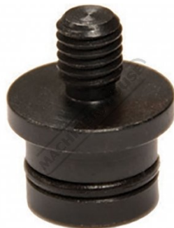
W07992 BuildPro Connector