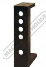
W08101 BuildPro Economy Stop & Clamping Square