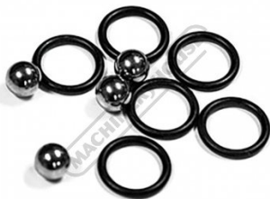
W08050 BuildPro Steel balls and O - Rings