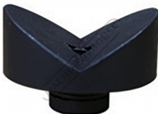
W08014 BuildPro V-Block