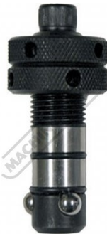
W08048 BuildPro Ball Lock Bolt