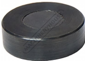
W08030 BuildPro Magnetic Rest Button