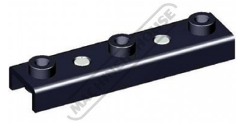
W07877 BuildPro Threaded Adaptor