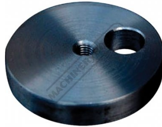
W08026 BuildPro Ecentric Pad