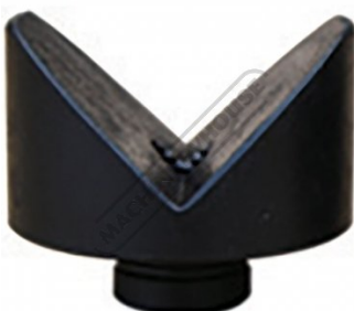
W08010 BuildPro V-Block