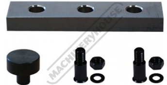
W07771 BuildPro Channel Block Kit