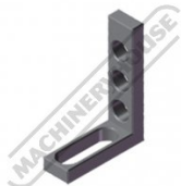
W08085 BuildPro Right Angle Bracket