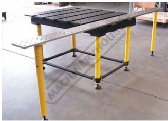
Use to Extend the Length or Width of the BuildPro Table