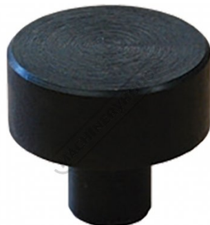
W08000 BuildPro Rest Button