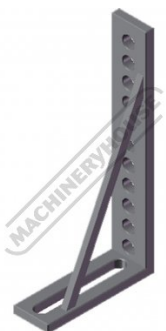
W08088 BuildPro Right Angle Bracket