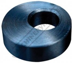
W08024 BuildPro Ecentric Pad