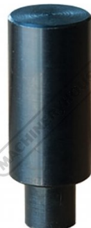
W08001 BuildPro Inserta Stop