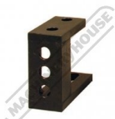
W08100 BuildPro Economy Stop & Clamping Square