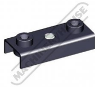
W07872 BuildPro Threaded Adaptor