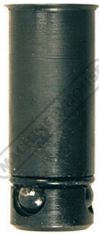
W08046 BuildPro Ball Lock Bolt