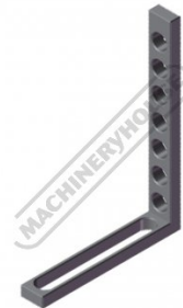
W08087 BuildPro Right Angle Bracket