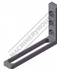
W08086 BuildPro Right Angle Bracket