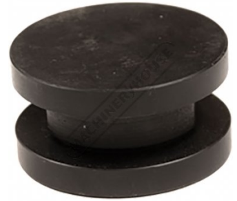
W08028 BuildPro Sliding Channel Base Button