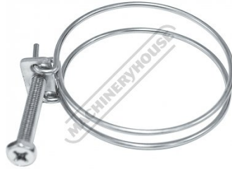
W3405 Dust Hose Clamp