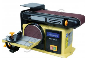
L105 Belt & Disc Linisher Sander