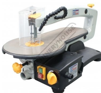
W352 Variable Speed Scroll Saw