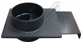
W335 Dust Hose Shut Off Valve