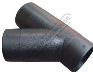
W337 Dust Hose Y Adaptor