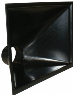
W338B Wood Lathe - Dust Chute - Big Gulp