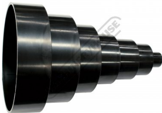
W3346 Dust Hose Stepped Reducer