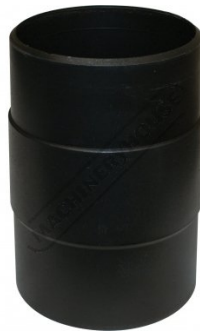
W334B Dust Hose Joiner