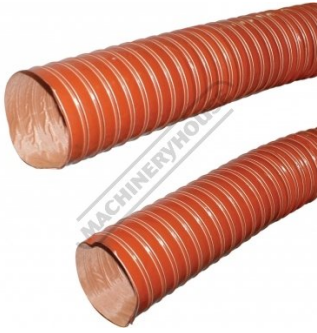
W322A Flame Retardant Dust Hose - Metal or Timber