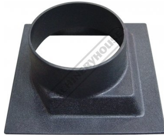
W338 Dust Hose Universal Dust Hood