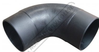
W336 Dust Hose Elbow