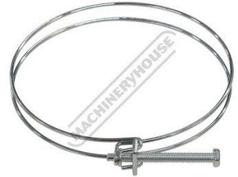
W341 Dust Hose Clamp