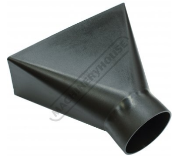
W338A Wood Lathe - Dust Chute Hood