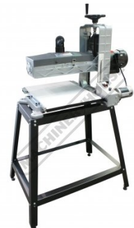
L110 Drum Sander