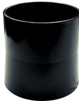
W3395 Quick Connect Adaptor