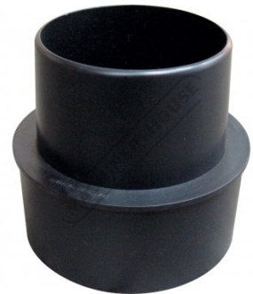
W333 Dust Hose Reducer