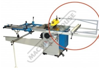
W459 Saw Guard Hood