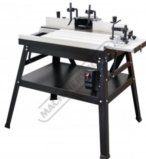
W4485 Router Table with Sliding Table