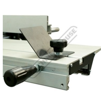
Adjustment Material Stop