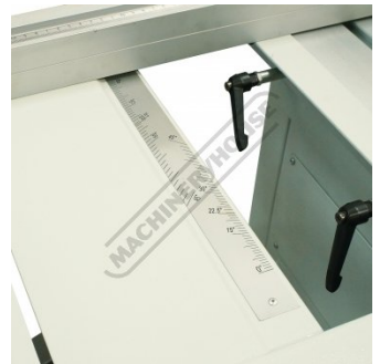
Degree Scale On Sliding Fence