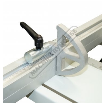
Mitre Guide Fence with Flip Over Stop