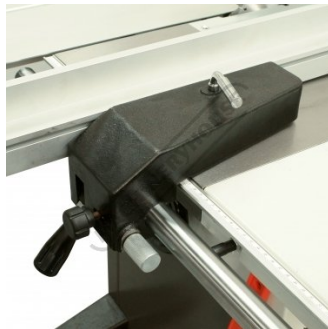
Heavy Duty Rip Fence Guide