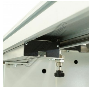
Aluminium Extrusion Box Design Slide