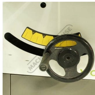
Blade Adjustment Handle