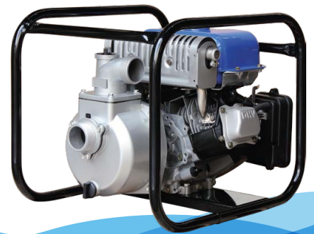
MY20 PUMP PERFORMANCE CURVE