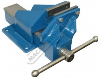
V0914 Steel Offset Fabricated Bench Vice - Right Hand