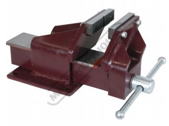
V069 Steel Offset Fabricated Bench Vice - Right Hand