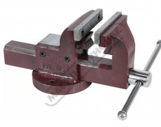
V081 Forge Steel Utility Bench Vice with Anvil & Pipe Jaws