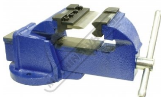
Shown Set Up on a Vice